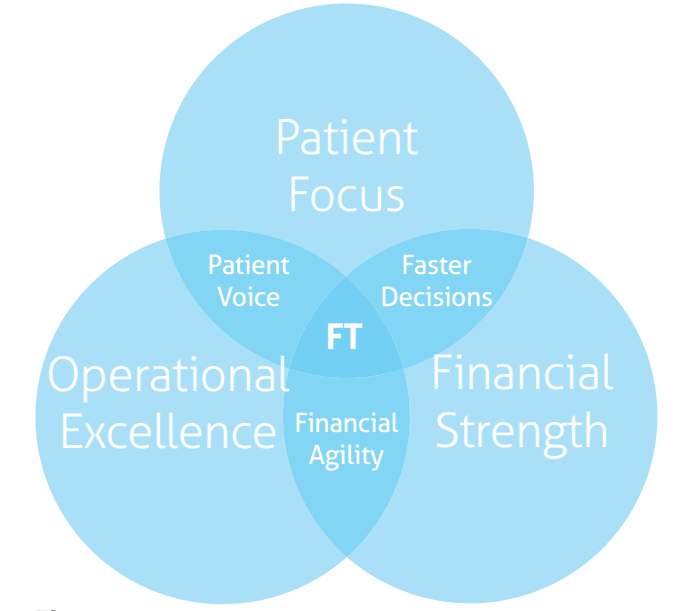
Figure 3.1: Foundation Trust status benefits and strategic synergies

The Trust initiated its FT application with a public consultation on its strategy and proposed governance structure in November 2011. The strategic goals outlined above demonstrate clear links with the benefits derived from foundation trust status, illustrated below in figure 3.1.