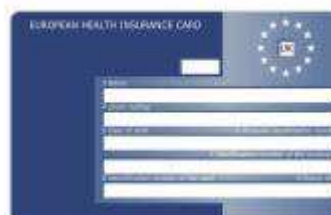
United Kingdom 80826