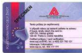
Czech Republic 80203